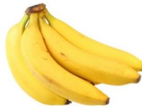
Bananas 1 Kg. ≈ 90 rub.