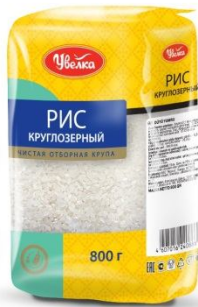
Pack of rice ≈ 80 rub.