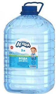
Water 5 L. ≈ 70 rub.