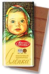
Chocolate bar ≈ 80 rub.