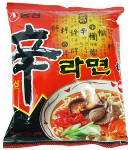
Noodles ≈ 50 rub.