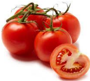
Tomatos 1 Kg. ≈ 120 rub.