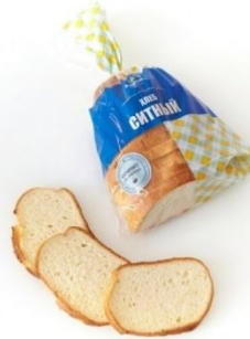
Bread ≈ 35 rub.